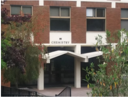
Chemistry Main Entrance