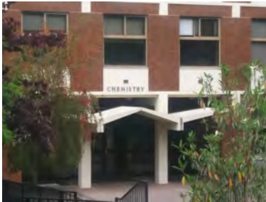
Chemistry Main Entrance