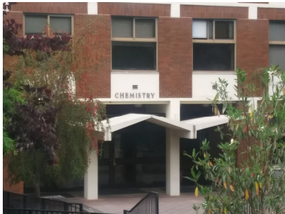
Chemistry Main Entrance