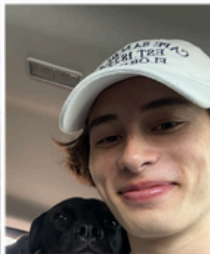
Lucas Data Science