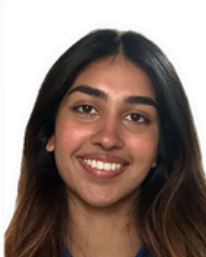
Simran Biology Pre-Med